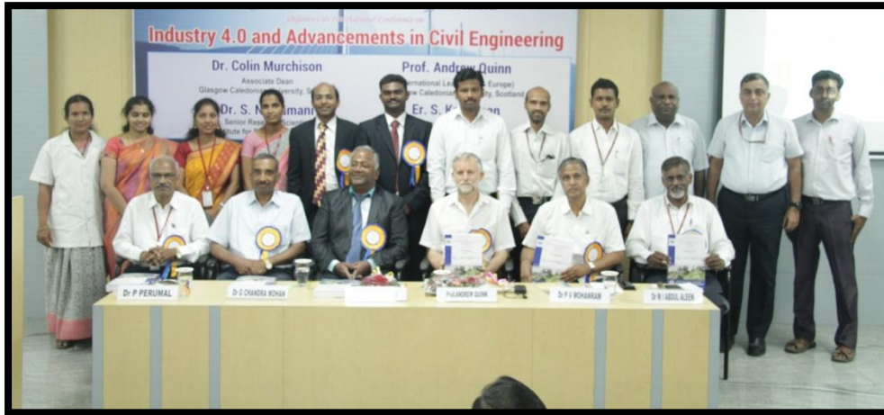
The guests and organizing team at the International conference on Industry 4.0 and Advancements in Civil Engineering