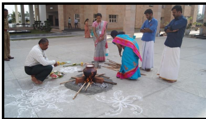
Pongal celebrations held on 23 rd January 2019 at Central Courtyard, PSG iTech