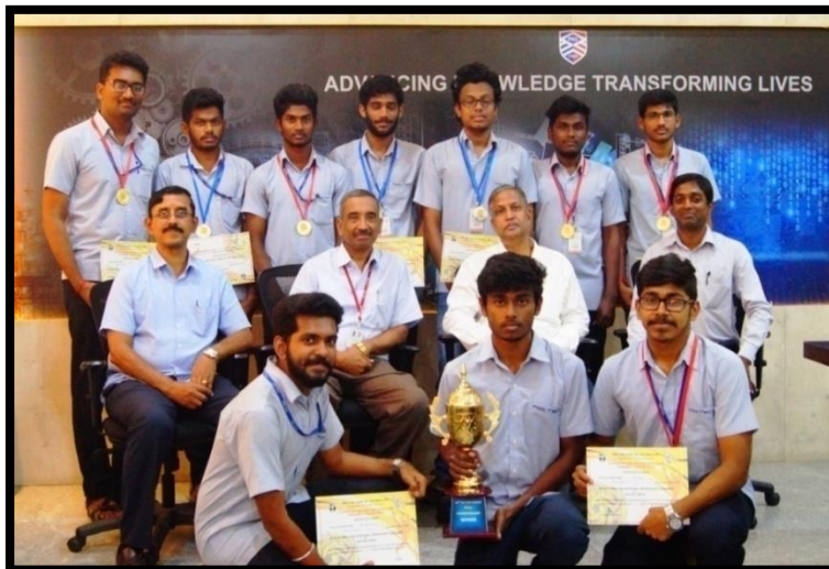
PSG iTech students won PSG Tech Trophy in Sepaktakraw (Men) Tournament, held at PSG Tech during 1st to 3rd February 2019