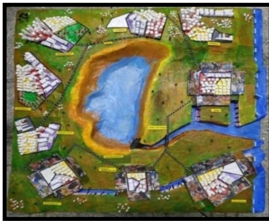
Flood Mitigation System Model showcased in the competition of Technology Exhibition 2019 at Anna University, Chennai on 8 th February 2019