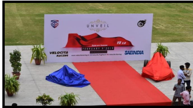
Unveiling of Electric Formula and Kart Vehicles

Ahead of the event, the chief guest unveiled the Electric Formula type race car and the Electric Go kart which was designed and fabricated by the students for the national level competition held at Buddh International Circuit, Greater Noida. The event began with the spiritual invocation song, followed by lighting the lamp by the dignitaries to mark the commencement of the programme.