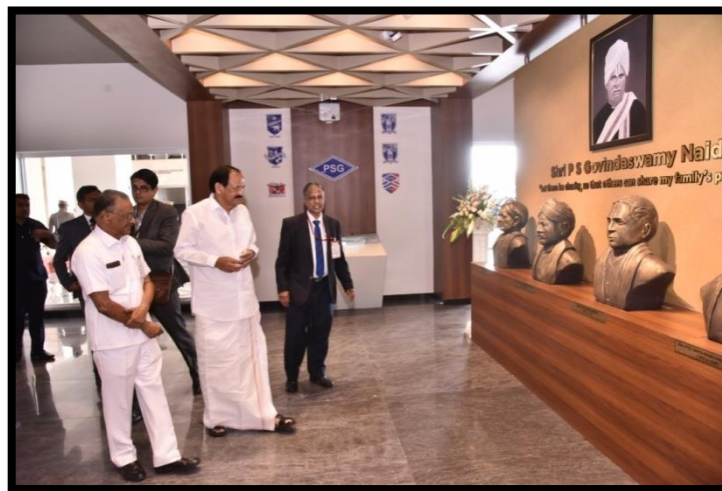
Honourable Vice President Shri M Venkaiah Naidu having a glimpse on the Hall of Fame on 14 th March