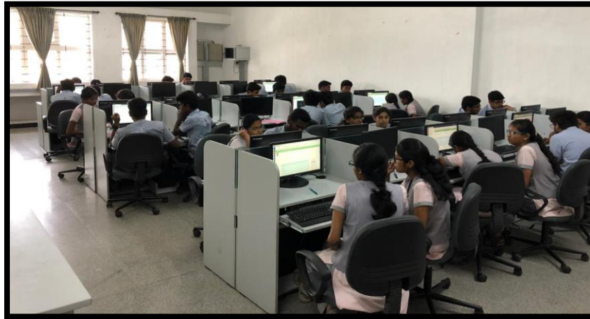
EEE Students participating in the CIRCUITRON competition conducted by the EEE Association held on 06.02.2019

The top three teams from each batch were awarded cash prizes.