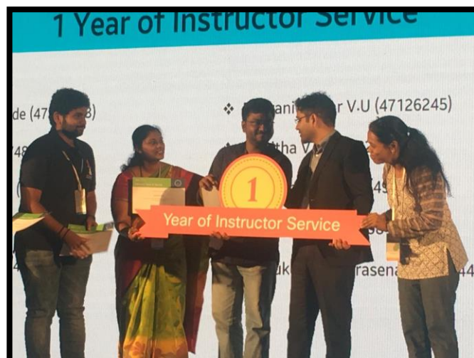
Year of Instructor Service Award presented to PSG iTech at CISCO® India Conference, Bangalore on 11 th February 2019