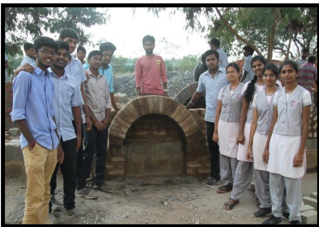
Construction of Arch by the Civil Engineering students on 03 rd February 2019 during the Hands on Training on “Brick Masonry Construction”