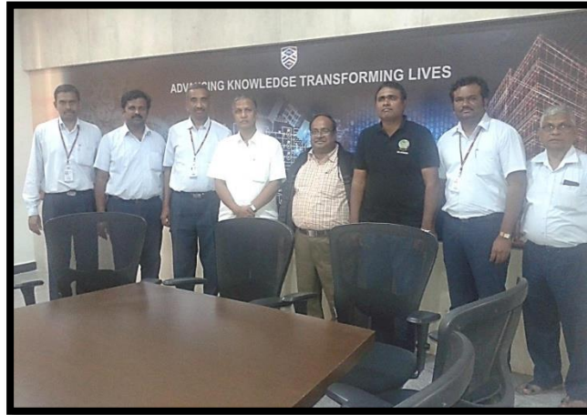
Visit of Scientists of NSTL-Vizag on 04.01.2019