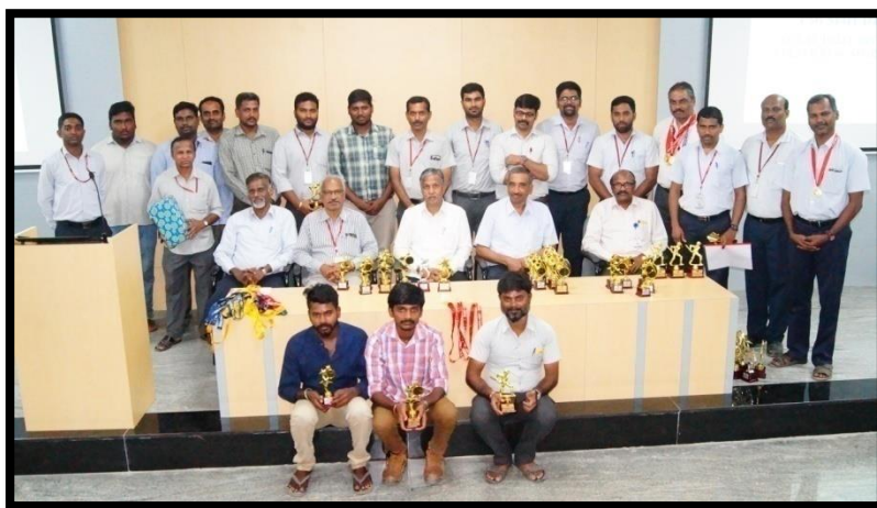
Group photo of the participants of the Staff Day 2019 on 1 st March 2019