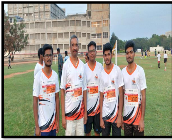
Typical Participants along with the Vice Principal of PSG iTech who took part in 7 km Marathon, organized by Organisation for Rare Diseases India (ORDI) on 3rd March 2019