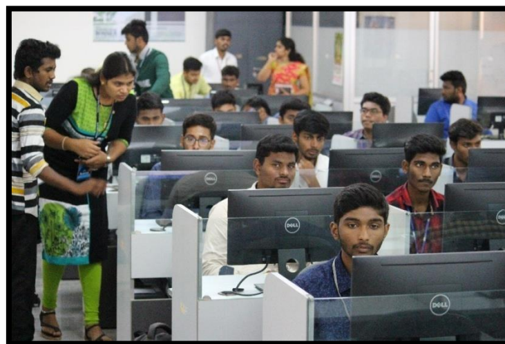
Students Participating in “Code Blitz” event during Yukta : 2019 on 12 th February 2019

A prodigious response had been observed from participants as Yukta: witnessed 1800+ students from different colleges distributed all over the state. Yukta: had 40 + events across five disciplines of Engineering-Civil, Mechanical, Computer Science, Electrical and Electronics. Workshops were themed, based on Artificial Intelligence, Robotics, Manufacturing, Internet of Things, Building Information Modelling and many more. Fun stalls and food stalls were set up around the campus. The spell-bound technical events had a total cash prize of around 1.5 lakh rupees. The main objective of this unique symposium was to bring all students, working in their respective domains of engineering together for mutual exchange of their ideas and presenting their results.