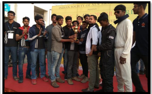
National Level Racing Event on “Formula Green and Electric Go Kart Design Challenge” at Buddh International Circuit, Greater Noida on 22 nd February 2019