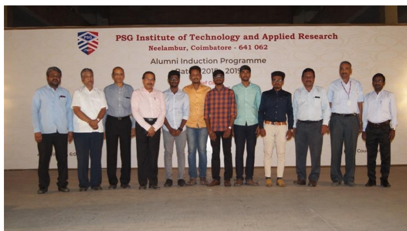
Alumni Induction Programme held on 4 th April 2019