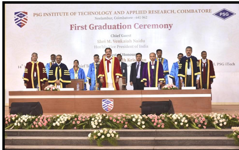
Dignitaries on the stage on First Graduation Ceremony of PSG iTech on 14 th March 2019